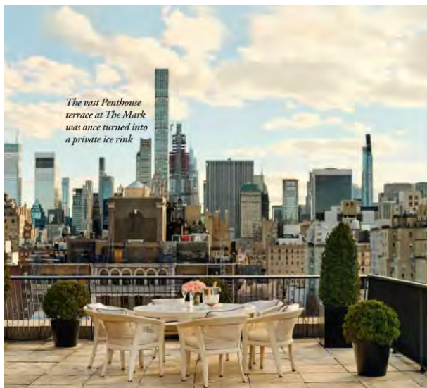
The vast Penthouse terrace at The Mark was once turned into a private ice rink