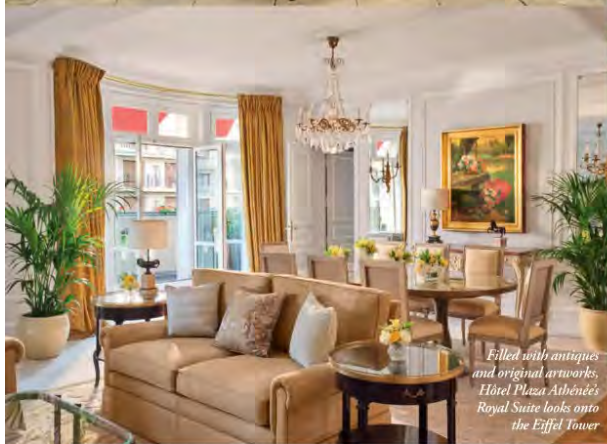
Filled with antiques and original artworks, Hôtel Plaza Athénée's Royal Suite looks onto the Eiffel Tower

The Mark is very Bonfire of the Vanities ; if you had to imagine the definitive lair of a Master of the Universe, it would be its fabled Penthouse, officially the largest hotel suite in the USA. Split over two levels, with five bedrooms and six bathrooms, it has a 2,500sqft terrace that overlooks Central Park. As for private dining, order in caviar on ice from Caviar Kaspia while the bellboys hotfoot it from the lobby to the lift to your room, pushing golden trolleys that bear the fruits of your hard day's shopping. (The suites are cream boudoirs with marshmallow-soft beds and deep, deep bathtubs.) The all-day restaurant by Jean-Georges is a fine-dining spectacle, where you can relish crispy salmon sushi and black truffle pizzas. If you need to recalibrate, there are spa therapists on hand, as well as immaculate blowdries at the Frédéric Fekkai Salon. If you want to make an excursion, avail yourself of the in-house chauffeurs; or for lower-key guests, the charming black-and-white bicycles. Truly, nothing here is too much trouble. Doubles from £998 ( themarkhotel.com ).